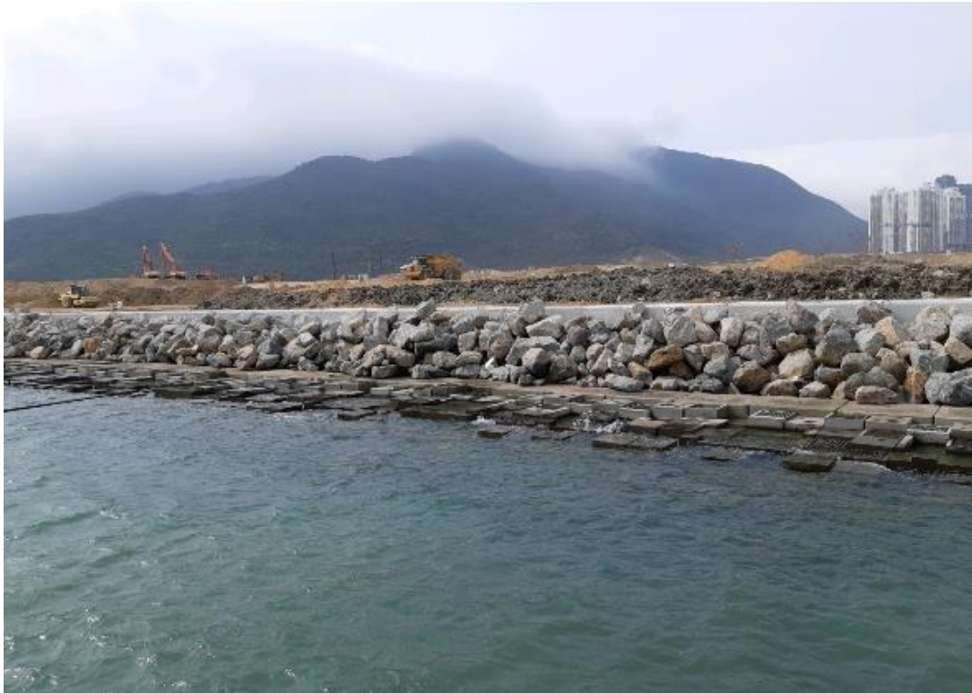
Photo 4 - Natural Rock Material/Planting for Artificial Seawall