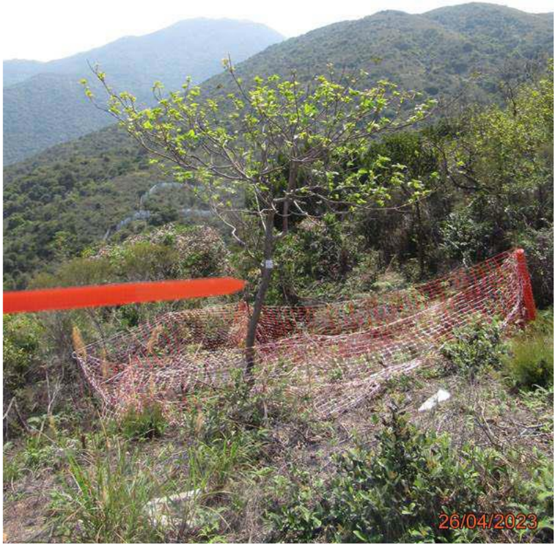
Photo 1 - Tree protection zone for preserved plant species of conservation importance