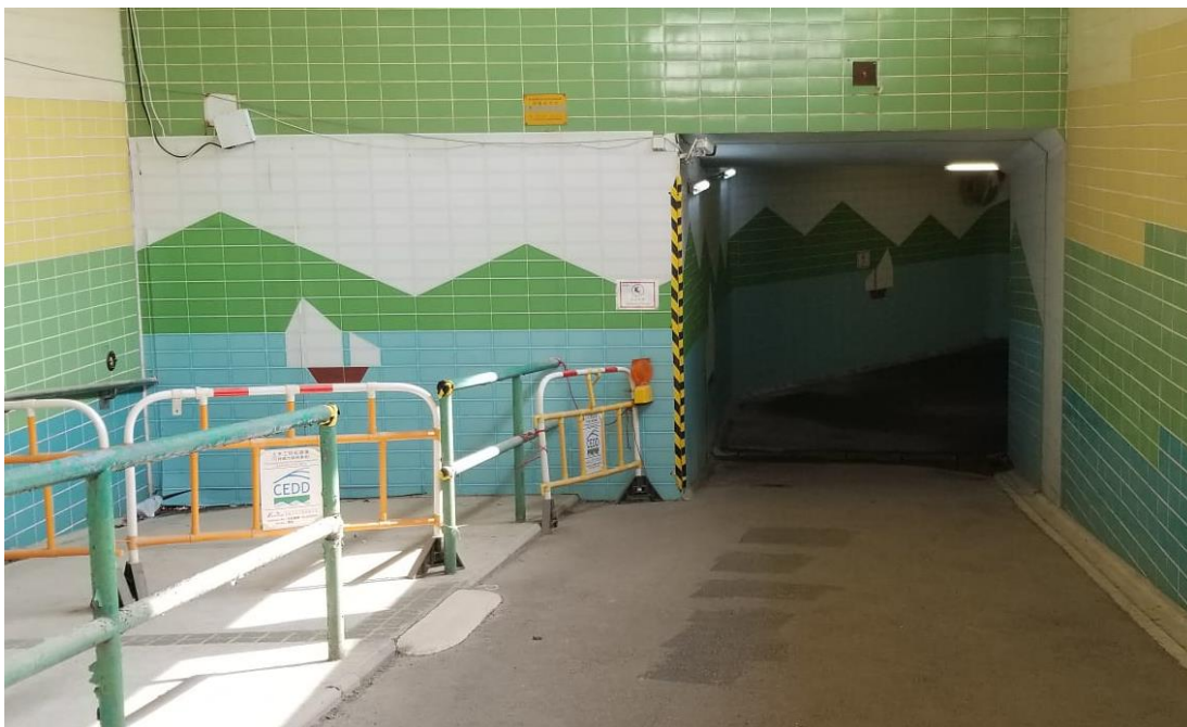
Photo 3 - Erection of site hoardings in unobtrusive colours